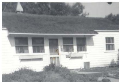
WWII U.S. Coast Guard Barracks 1964

My daddy (lightkeeper) used seine nets. He put the fish in a big wash tub. I sold them to Corbett's Fish Market on Bay Street. Daddy would give me half the money, 'cause I'd take them over. I was driving at 14. Back in those days there was one keeper on duty. Everyday they took tours in the lighthouse starting at one o'clock. The horse and carriages used to bring from town the tourists.