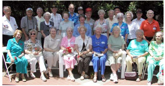
U.S. Coast Guard Ponce Training Station Annual Veterans Reunion at the Museum

Join us as we host a series of roundtables on specific topics such as “How Keeping the Light has Changed Over Time.” On-site reunions of military or Junior Service League members who saved the Light Station are great opportunities to bring photos or tell your stories.