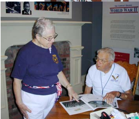
Veterans sharing their stories with the public in the USCG exhibit on Veterans' Day